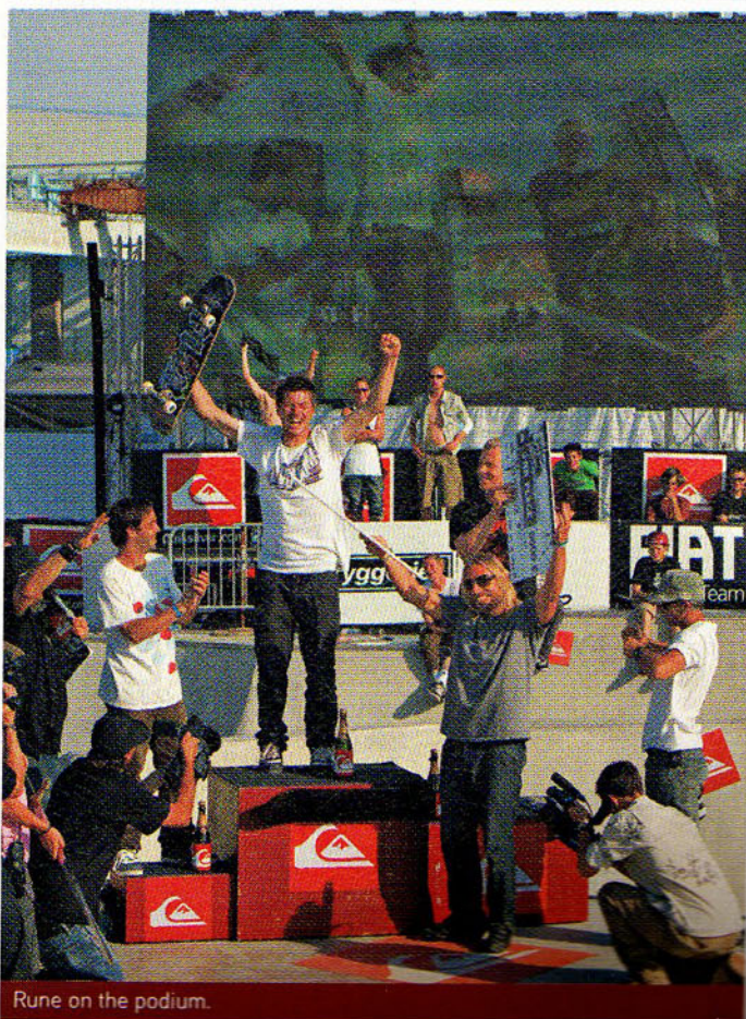
Rune on the podium.