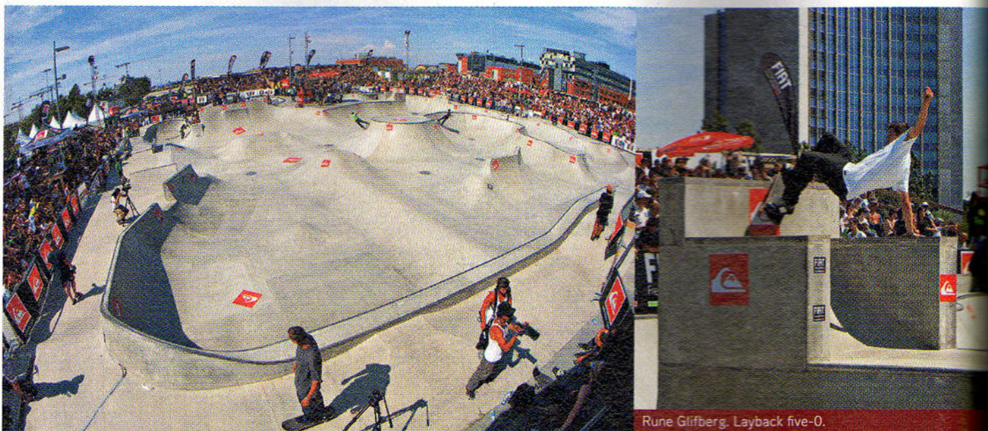
Rune Glifberg, Layback five-0.